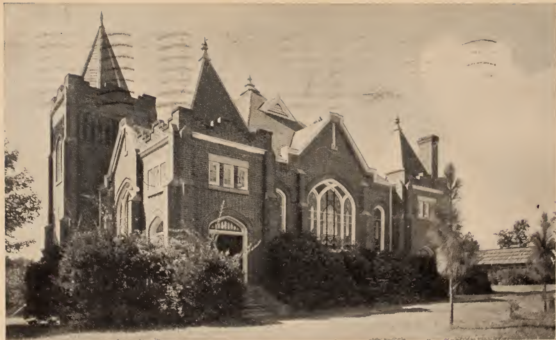
First Presbyterian Church, Carthage, North Carolina