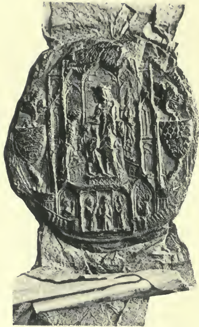
Seal of King's Hall