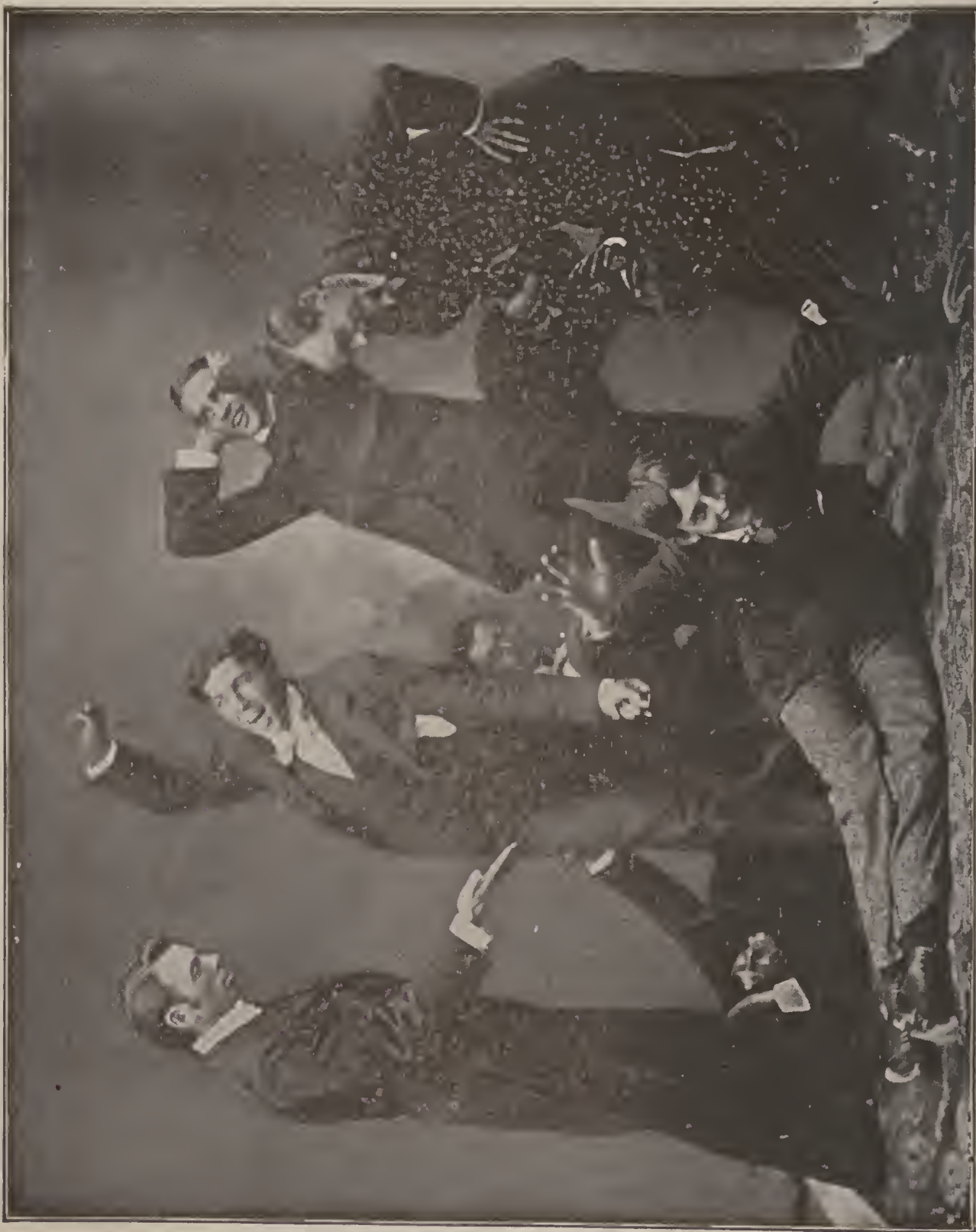
YOUNG MEN CONVULSED WITH LAUGHTER AT THE COMMAND OF THE HYPNOTIST.