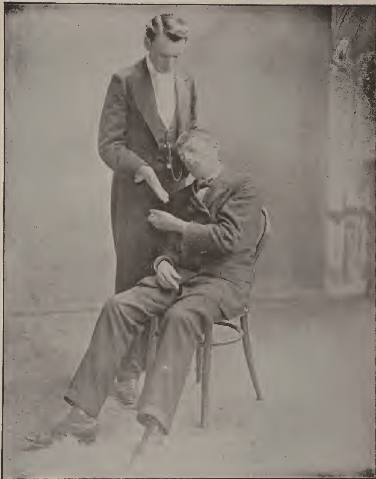
SUBJECT IN A COMPLETE STATE OF ANÆSTHESIA, HAVING ORDINARY STEEL HAT PINS PUSHED THROUGH THE ARM AND FACE. IN THIS CONDITION A SURGICAL OPERATION CAN BE PERFORMED WITHOUT PAIN.