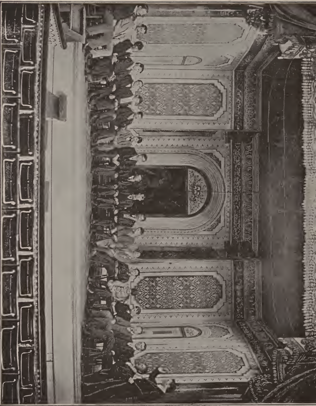
HYPNOTIZING A LARGE NUMBER AT ONCE.