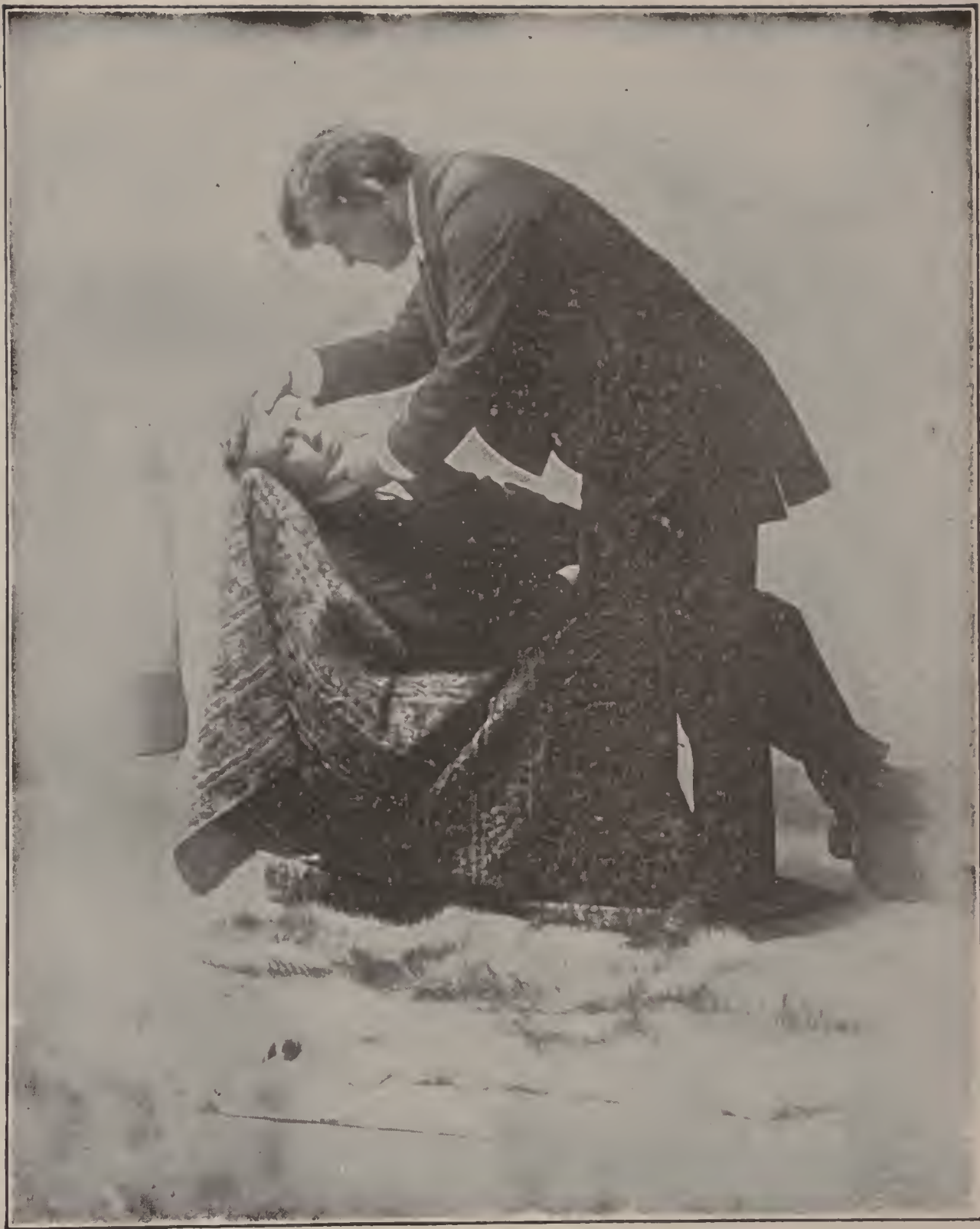
PATIENT BEING TREATED BY HYPNOTISM FOR A SEVERE CASE OF NEURALGIA.