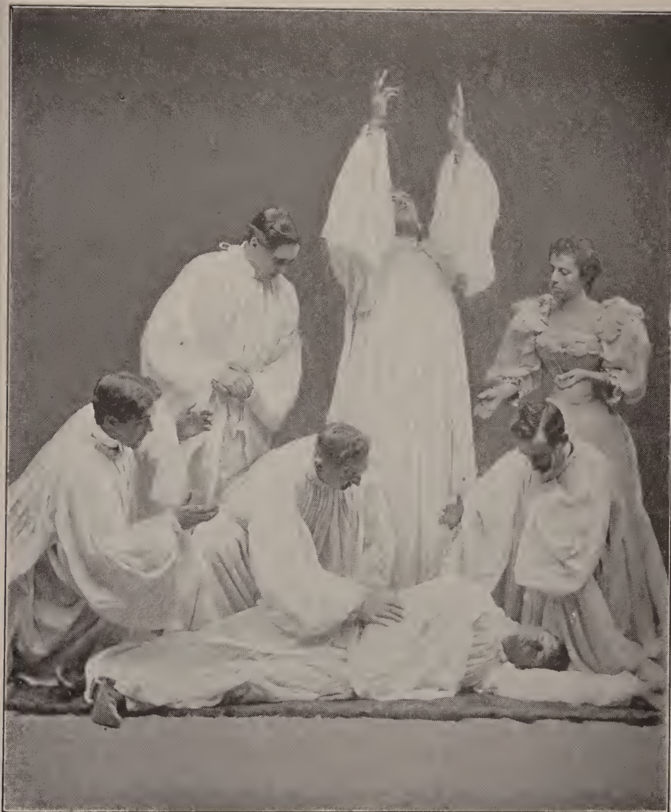
SUBJECTS IN A CATALEPTIC STATE (WITH THE LIMBS PERFECTLY RIGID) POSED TO REPRESENT A DEATH SCENE. THE PICTURE GIVES ONE BUT LITTLE IDEA OF THE SCENE ITSELF WITH COLORED LIGHTS FLICKERING THEREON. ALSO MUCH OF THE FACIAL EXPRESSION HAS BEEN LOST IN ENGRAVING.