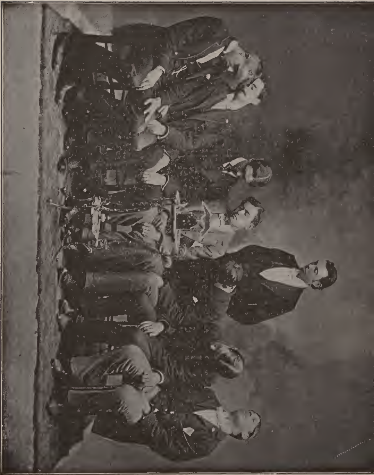
PEOPLE FALL INTO A HYPNOTIC STATE FROM LOOKING AT LUV'S REVOLVING MIRROR.