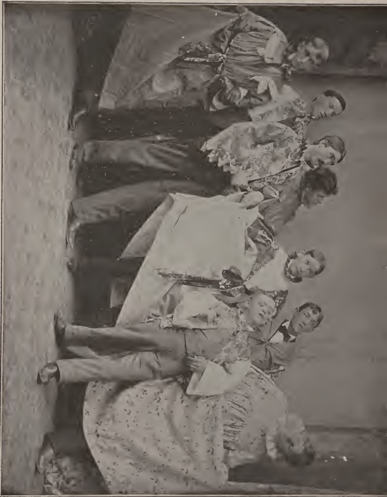
HYPNOTIZED YOUNG MEN BELIEVE THEMSELVES TO BE DARKIES PARTICIPATING IN A GREAT CAKE WALK.