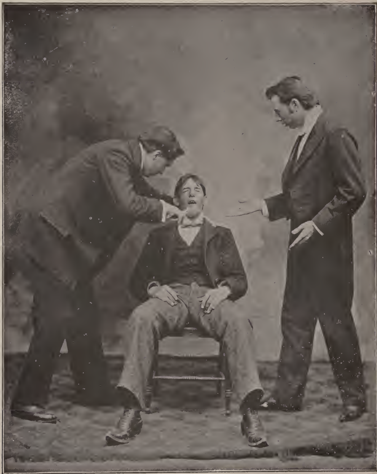
EXTRACTING A TOOTH UNDER HYPNOTIC INFLUENCE. THE PATIENT PERCEIVES NO PAIN WHATEVER, NOR IS THERE ANY SORENESS IN THE GUMS AFTER THE OPERATION.