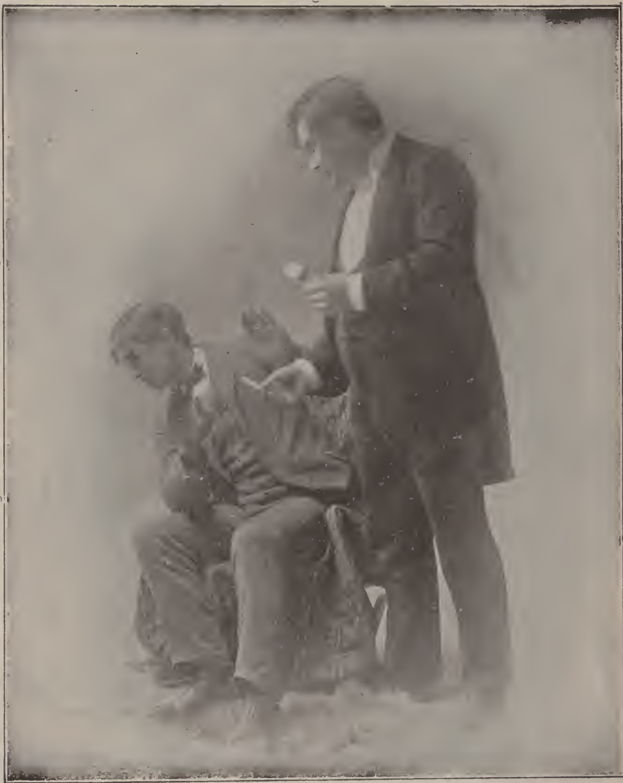
THE YOUNG MAN IN THE PICTURE HAS JUST BEEN HYPNOTIZED AND HAD SUGGESTIONS GIVEN TO BREAK HIM OF SMOKING CIGARETTES. THE VERY SIGHT OF ONE NOW TURNS HIM DEATHLY SICK.