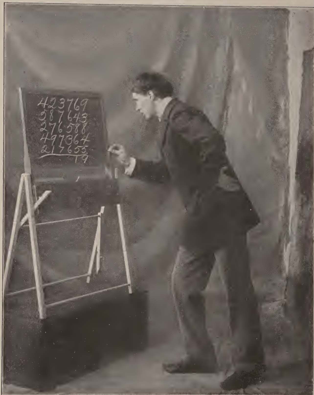
THIS YOUNG MAN NOW ADDS FIGURES AT THE RATE OF 150 PER MINUTE, WHILE ONLY A SHORT TIME AGO HE COULD NOT ADD 75 PER MINUTE. THIS RESULT WAS BROUGHT ABOUT BY HYPNOTIC SUGGESTION, THIS CUT SHOWING HIM WHILE BEING DRILLED UNDER HYPNOSIS.