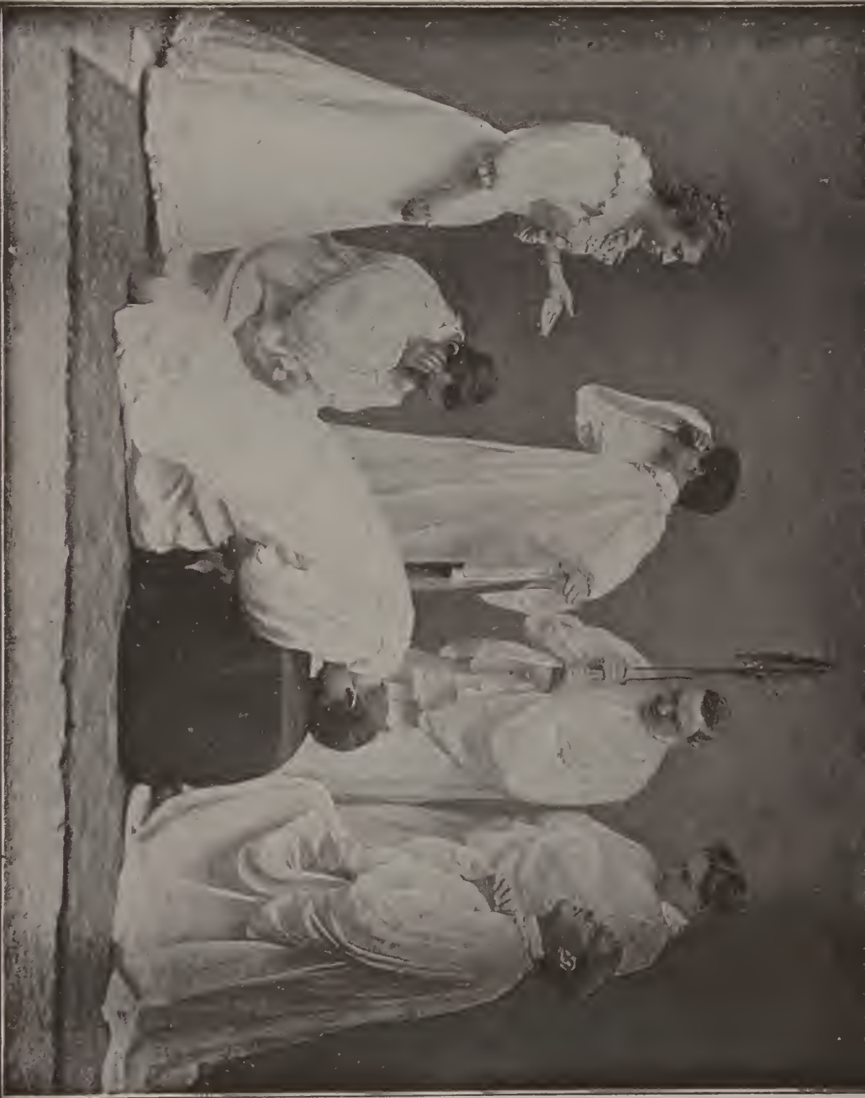
YOUNG MEN IN CATAPLEPTIC STATE POSED TO REPRESENT AN EXECUTION SCENE. THE PICTURE DOES NOT DO THE SCENE JUSTICE, AS COLORED LIGHTS WERE THROWN ON THE ORIGINAL, AND AGAIN THE FACIAL EXPRESSIONS HAVE BEEN MARRED IN ENGRAVING.