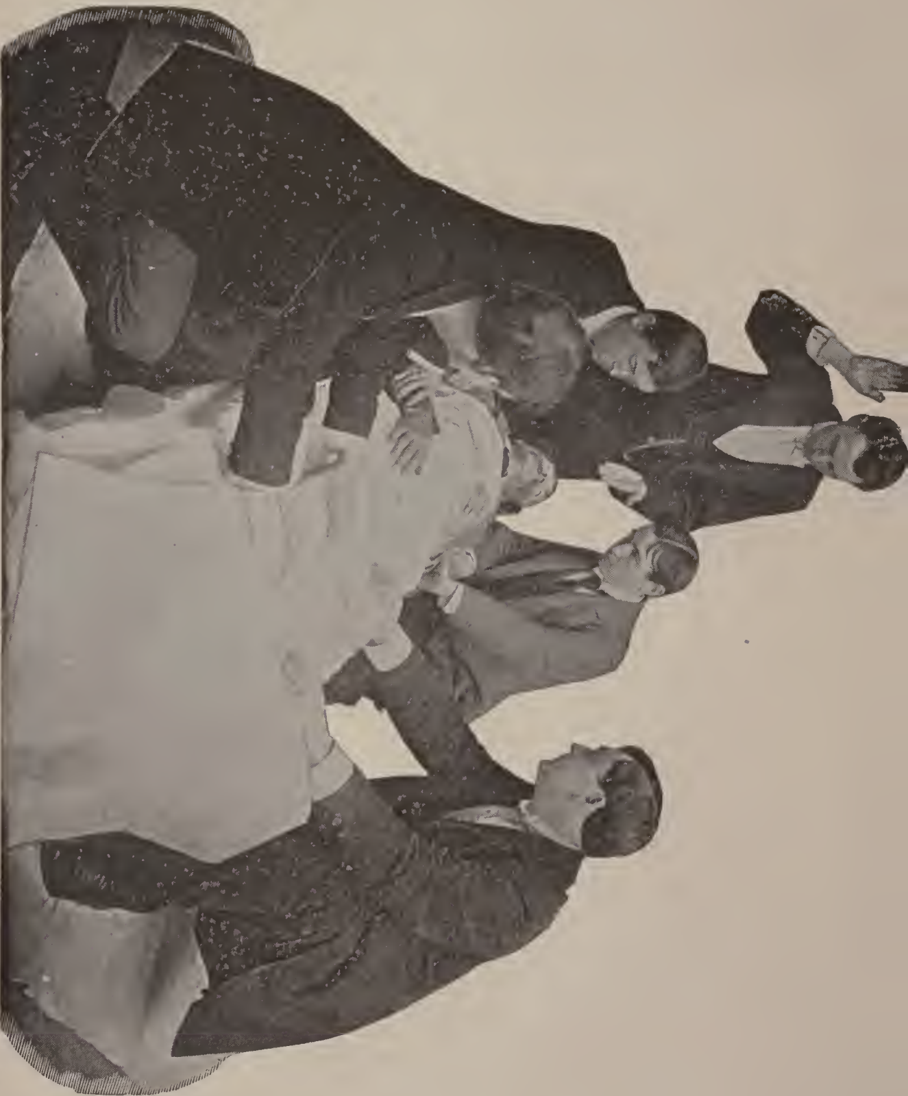
THIS PICTURE REPRESENTS THE AWAKENING OF A HYPNOTIZED YOUNG MAN WHO HAS BEEN UNDER THE INFLUENCE A NUMBER OF DAYS WITHOUT FOOD OR DRINK, HAVING ALL THE FUNCTIONS OF THE BODY, EXCEPT THE VITAL, ENTIRELY SUSPENDED.