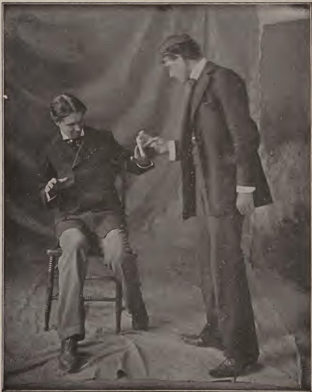
THE PATIENT CAN NO LONGER DRINK INTOXICATING BEVERAGES. HE IS JUST TRYING TO SWALLOW SOME, AFTER HAVING BEEN HYPNOTIZED, BUT THE VERY SIGHT OF LIQUOR MAKES HIM DEATHLY SICK.